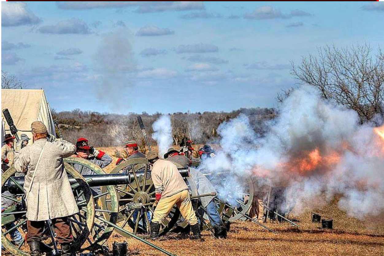
A Confederate reenactor battery unleashes a volley at Union forces in a portrayal from the Crazy Crow Trading Post website describing this year's battle reenactment at Yale, OK, on February 14 to 16.